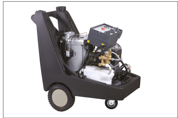
Panel de control de 24 V 24 V Control Panel